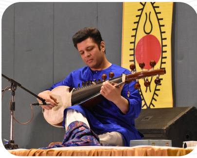
Amaan Ali Bangash Sarod Maestro