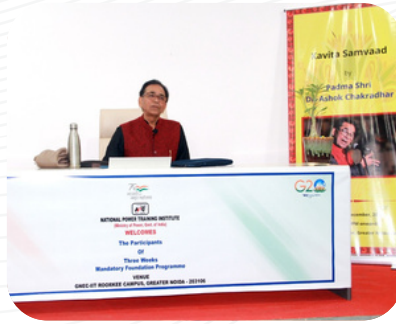
Padma Shri Ashok Chakradhar, Indian author, poet and former head of the department of Hindi at Jamia Millia Islamia